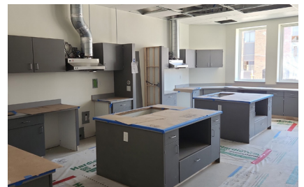
Above: Millwork and hood installation at FACS room.