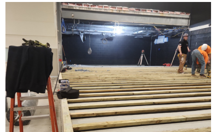
Above: Stage work continues.