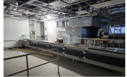
Above: Cafeteria serving counter installation.

Phase 9: The final phase includes the renovation of the balance of the existing 1st floor classroom wing, and miscellaneous exterior work on and around the building.