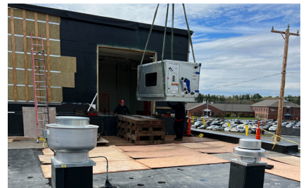
Above: Mechanical unit being installed into mechanical room.